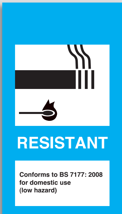
BS7177 label for Low Hazard