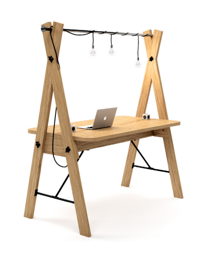
WIGWAM / Oak frame and top