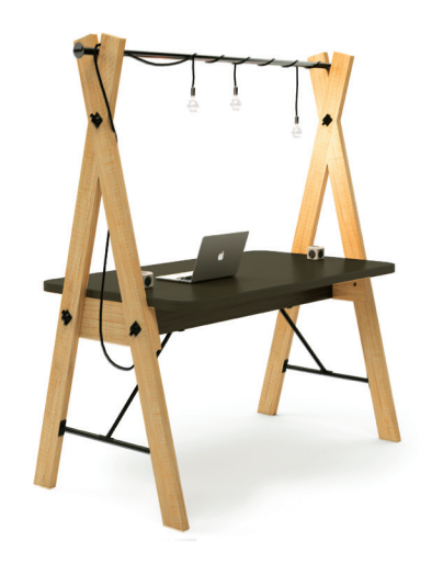
WIGWAM / Oak frame and black top