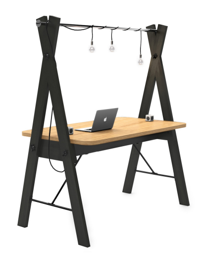
WIGWAM / Black frame and oak top