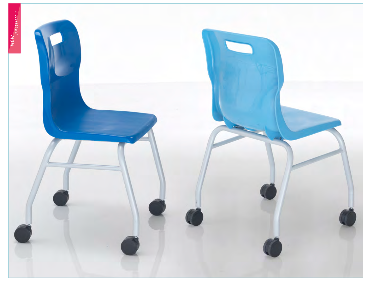
TITAN MOVE Page 18 - 21