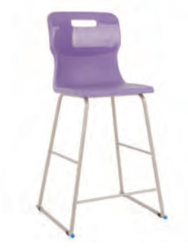
T63 - SIZE 6 AGES 13+

Overall dimensions: D530 W550 H1020 Seat dimensions: D406 W423 H685 Weight capacity: 140kg