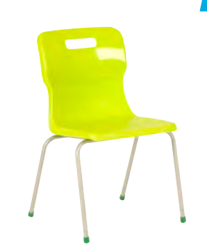
T15 - SIZE 5 AGES 9 - 13

Overall dimensions: D416 W438 H700 Seat dimensions: D320 W387 H380 Weight capacity: 95kg