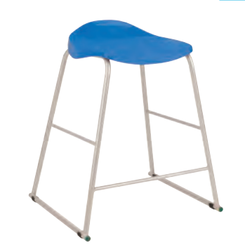
T92 - SIZE 5 AGES 9 - 13

Overall dimensions: D530 W550 H600 Seat dimensions: D361 W365 H560 Weight capacity: 97kg