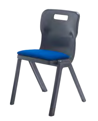
T8 - FABRIC SEAT PAD

Overall dimensions: D345 W365 Upholstered in Bradbury Pyra fabric Minimum order quantity of 5