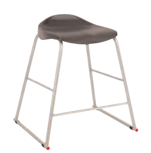
T91 - SIZE 4 AGES 7 - 9

Overall dimensions: D530 W550 H495 Seat dimensions: D361 W365 H445 Weight capacity: 97kg