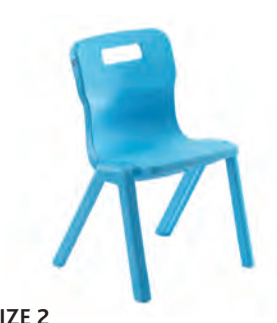
T2 - SIZE 2 AGES 3 - 4

Overall dimensions: D320 W360 H513 Seat dimensions: D279 W275 H260 Weight capacity: 97kg