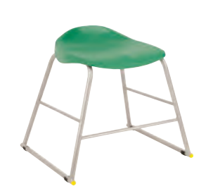
T90 - SIZE 3 AGES 5 - 7

Overall dimensions: D530 W550 H495 Seat dimensions: D361 W365 H445 Weight capacity: 97kg