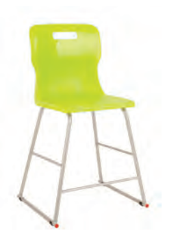
T61 - SIZE 4 AGES 7 - 9

Overall dimensions: D530 W550 H820 Seat dimensions: D406 W423 H445 Weight capacity: 95kg