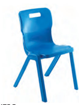
T5 - SIZE 5 AGES 9 - 13

Overall dimensions: D408 W432 H690 Seat dimensions: D331 W340 H380 Weight capacity: 107kg