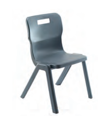
T6 - SIZE 6 AGES 13+

Overall dimensions: D486 W480 H799 Seat dimensions: D414 W370 H430 Weight capacity: 115kg