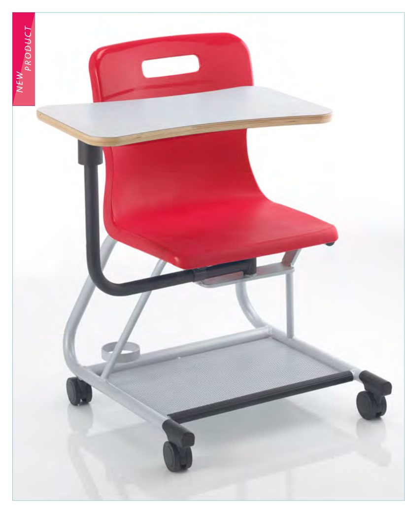
TITAN TEACH Page 18 - 21