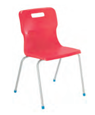
T16 - SIZE 6 AGES 13+

Overall dimensions: D495 W497 H820 Seat dimensions: D406 W423 H460 Weight capacity: 140kg