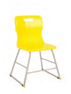
T60 - SIZE 3 AGES 5 - 7

Overall dimensions: D530 W550 H820 Seat dimensions: D406 W423 H445 Weight capacity: 95kg