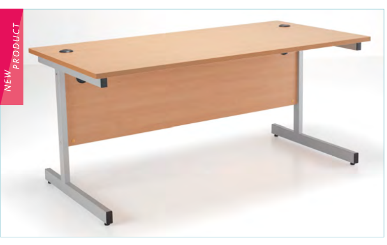
TEACHERS DESK Page 44 - 45