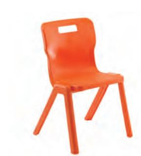
T3 - SIZE 3 AGES 5 - 7

Overall dimensions: D343 W363 H563 Seat dimensions: D279 W275 H310 Weight capacity: 97kg