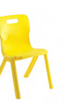
T4 - SIZE 4 AGES 8 - 9

Overall dimensions: D408 W432 H690 Seat dimensions: D331 W340 H380 Weight capacity: 107kg