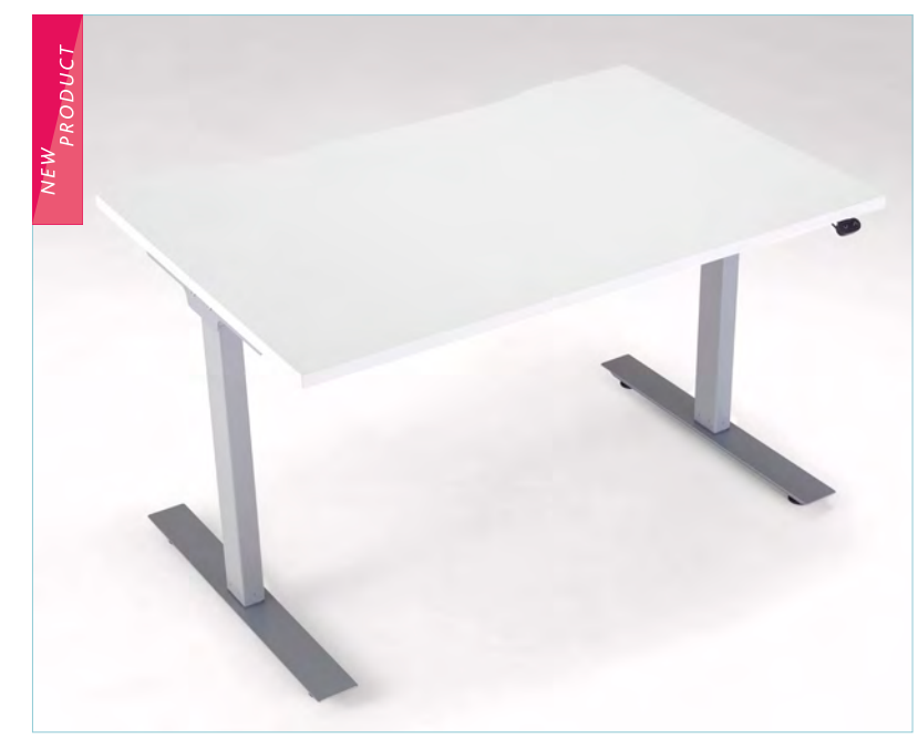
HEIGHT ADJUSTABLE DESK Page 44 - 45