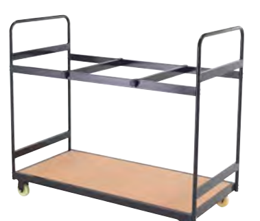
TCEDT-UNI - EXAM DESK TROLLEY

Overall dimensions: D1225 W660 H1150 Desk capacity: 25 exam desks