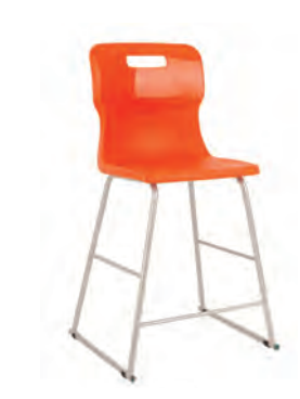
T62 - SIZE 5 AGES 9 - 13

Overall dimensions: D530 W550 H920 Seat dimensions: D406 W423 H560 Weight capacity: 95kg