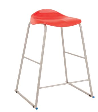
T93 - SIZE 6

Overall dimensions: D530 W550 H725 Seat dimensions: D361 W365 H685