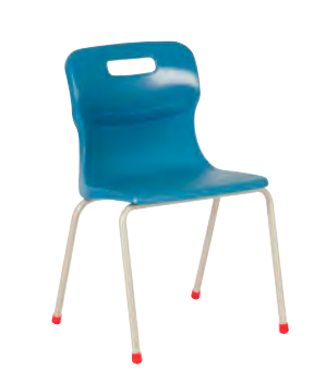
T14 - SIZE 4 AGES 8 - 9

Overall dimensions: D398 W438 H670 Seat dimensions: D320 W387 H350 Weight capacity: 95kg