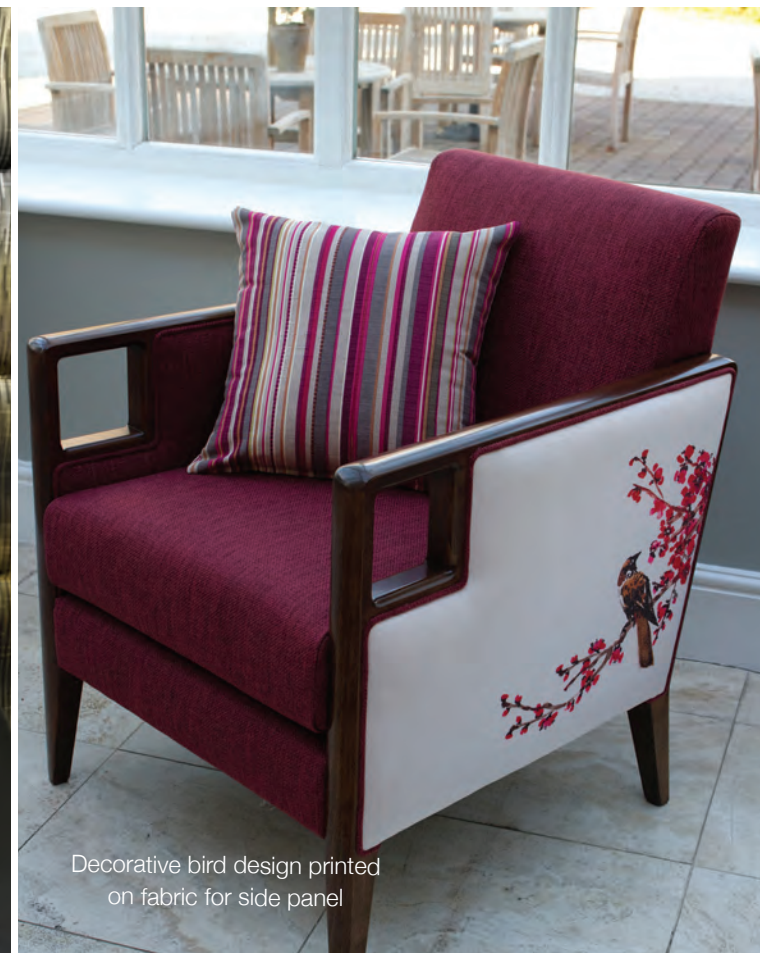
Decorative bird design printed on fabric for side panel