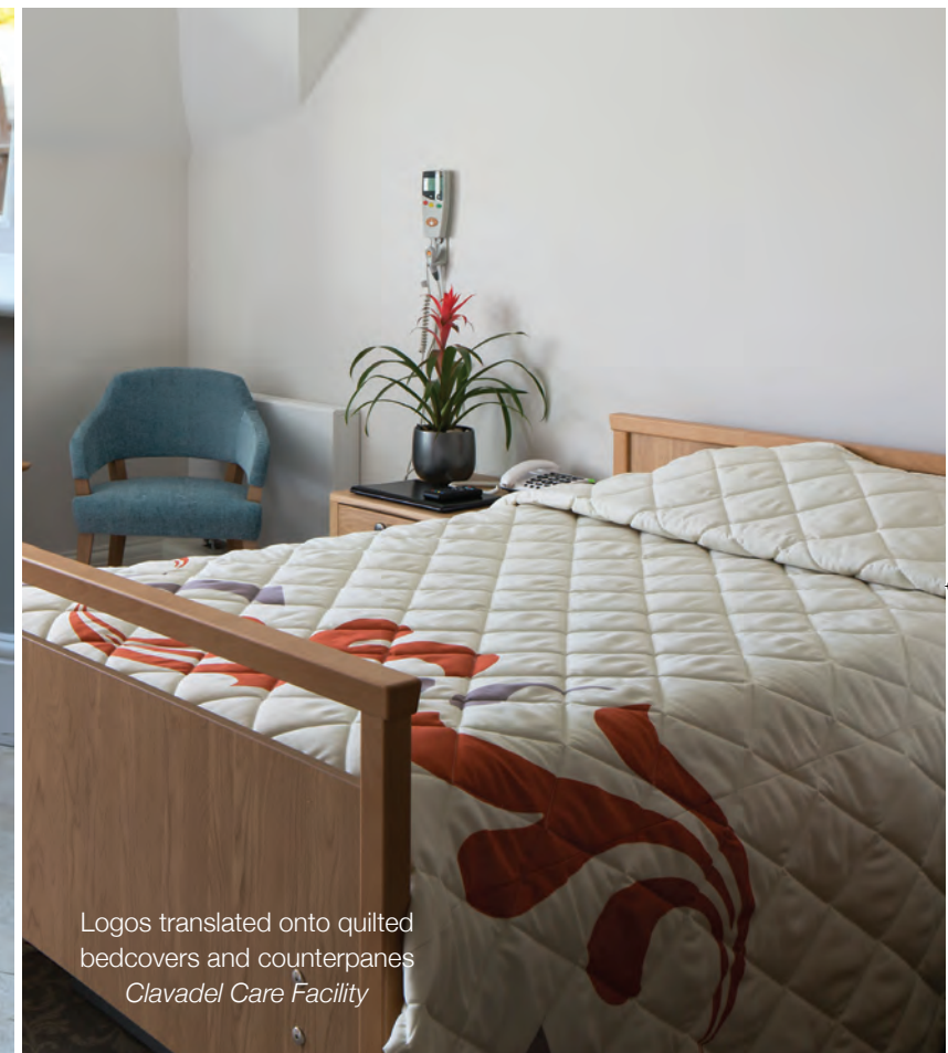
Logos translated onto quilted bedcovers and counterpanes Clavadel Care Facility