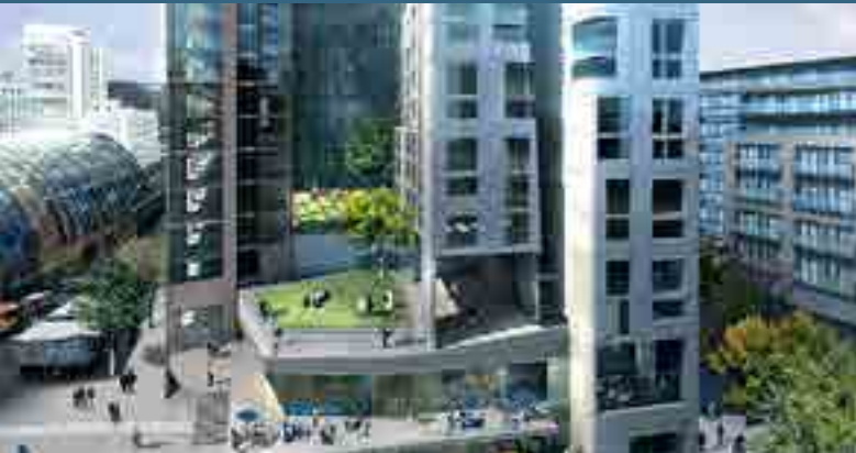
Delancey, Elephant & Castle Redevelopment