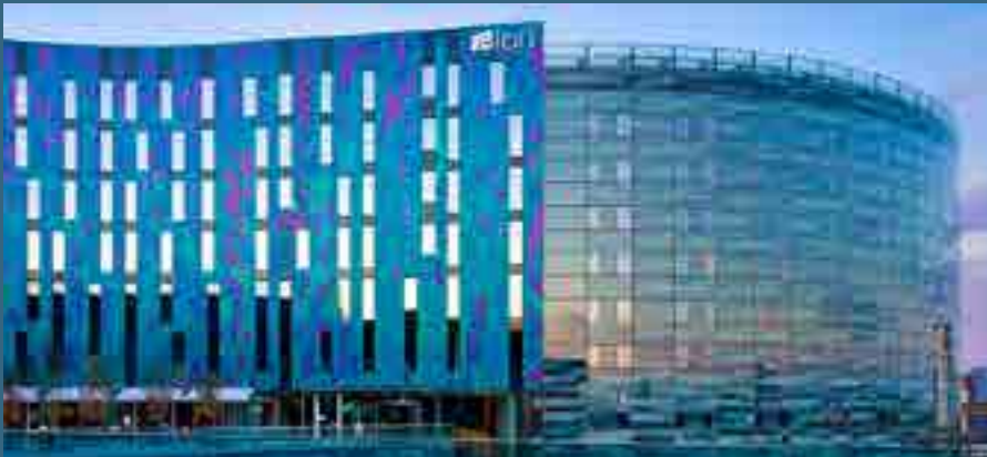
Aloft London Excel