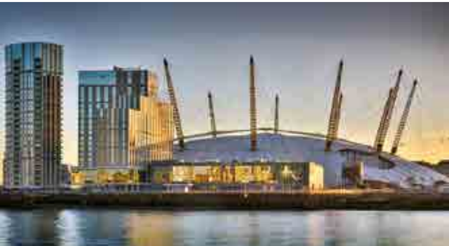
InterContinental Hotel London - The O2