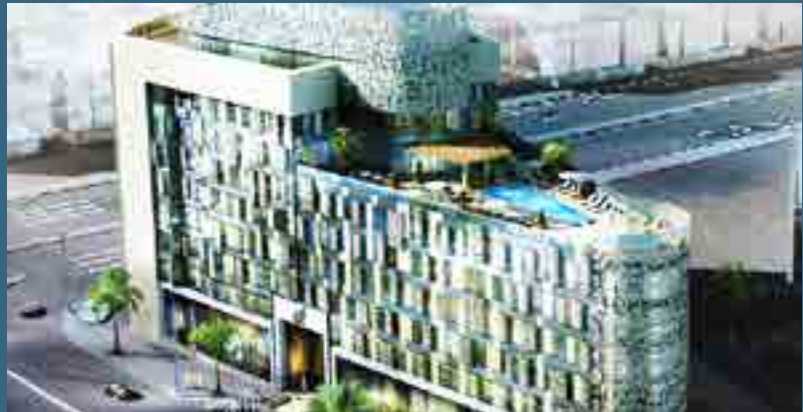
Fraser Suites Riyadh