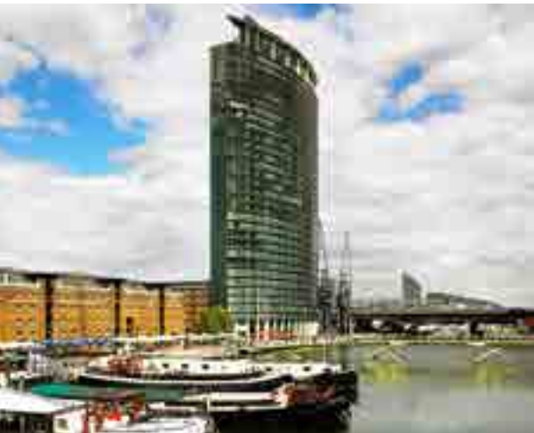
Marriott Hotel - West India Quay