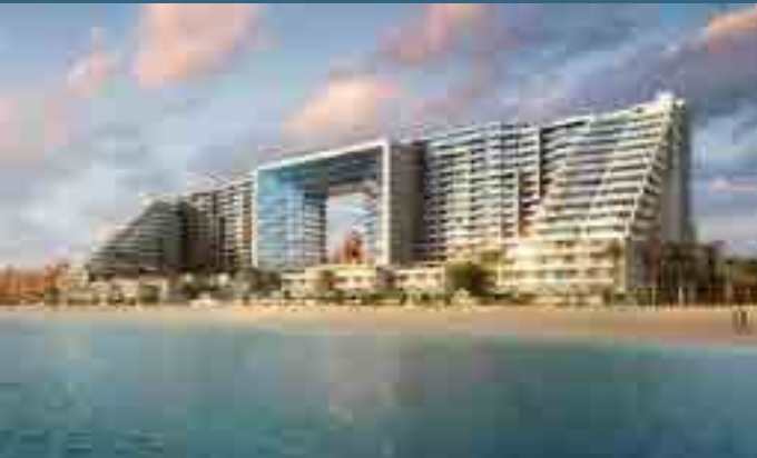
Five Palm Jumeirah - Dubai