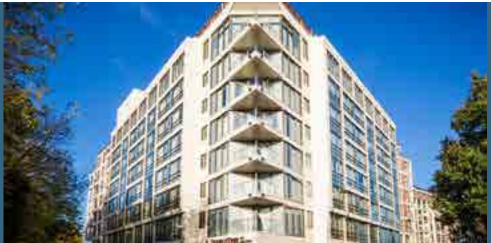
Hilton DoubleTree - Kingston