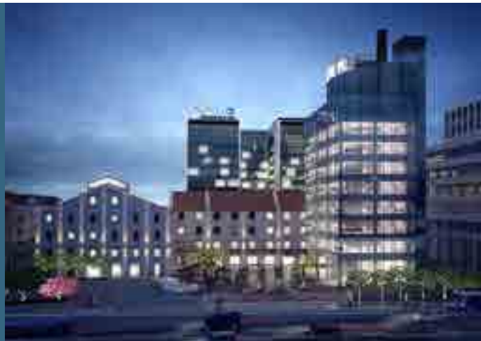
Radisson Blu Old Mill Hotel - Belgrade