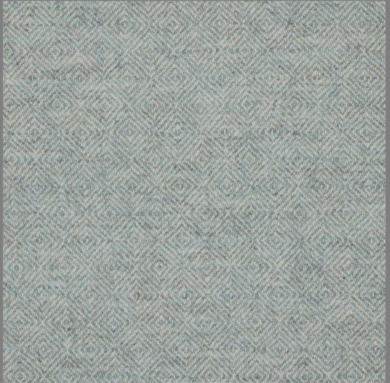
Diamond Slate creates a contemporary look on this visitors chair